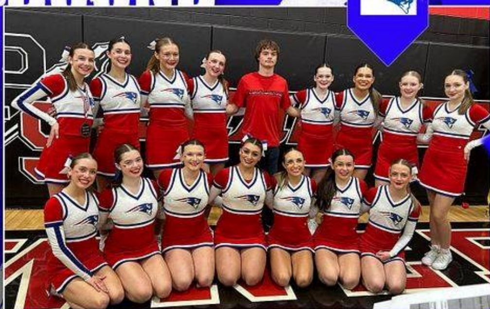
GAMEDAY & TRADITIONAL CHEER SQUADS ARE GOING TO COLUMBUS!

STATE BOUND STATE STATE STATE STATE STATE STATE